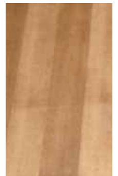
Barber Pole Effect

The resulting Barber Pole Effect, viewed as light and dark stripes across a door face, is not considered a manufacturing defect and is a natural occurrence in practically all cuts of wood veneer. The Barber Pole Effect can be minimized with proper sanding and finishing techniques and managed by switching to slip match faces.