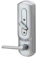
Tubular interconnected locks