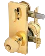
Cylindrical interconnected locks