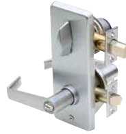
Tubular interconnected locks