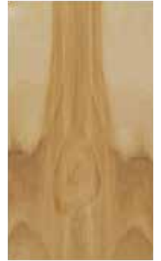
Heartwood vs Sapwood

Be mindful of the variation in the context of the design intent for your project. Also, be aware that wood variability in its true, natural state cannot be controlled.