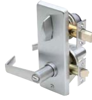
Tubular interconnected locks