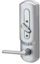
Tubular interconnected locks