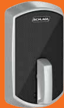
Schlage Control™ Smart Deadbolt