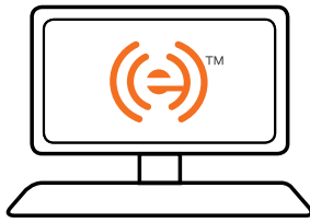
ENGAGE web APP