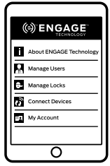
ENGAGE mobile APP